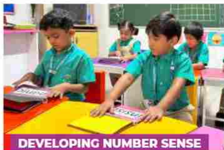
DEVELOPING NUMBER SENSE