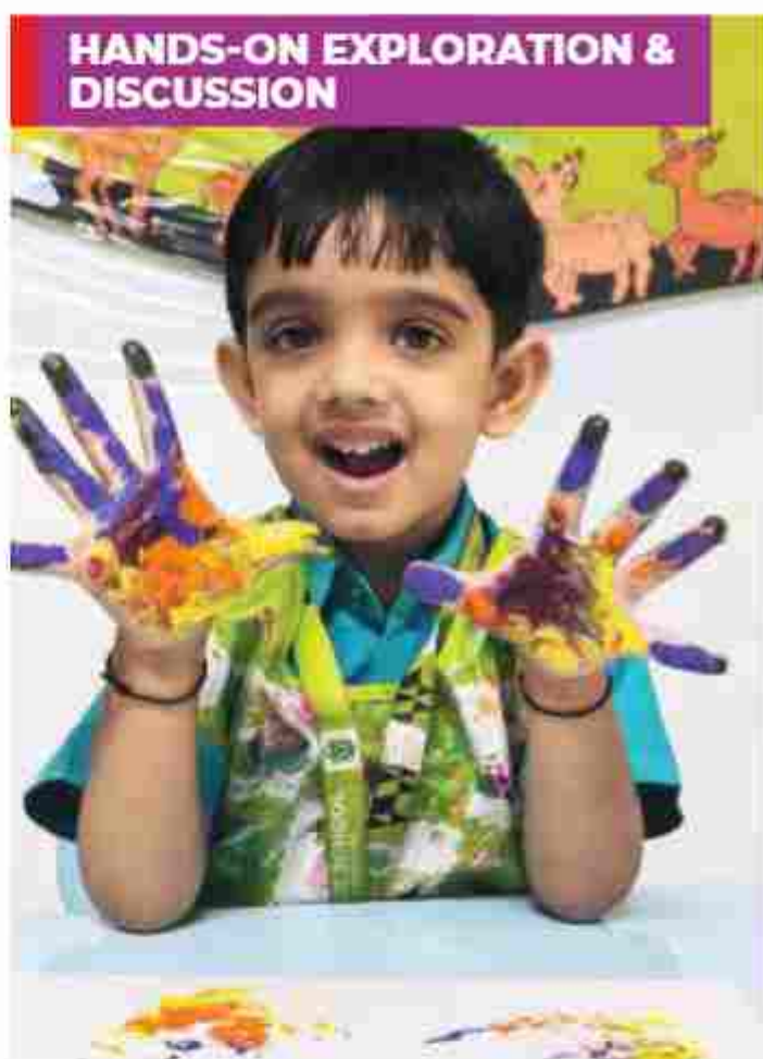
HANDS-ON EXPLORATION & DISCUSSION