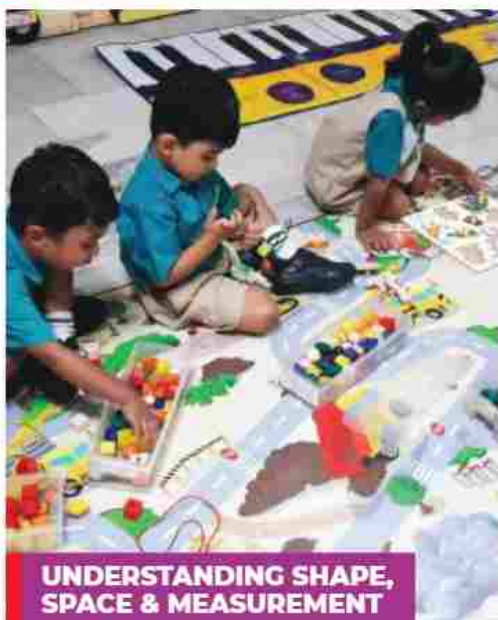
UNDERSTANDING SHAPE, SPACE & MEASUREMENT