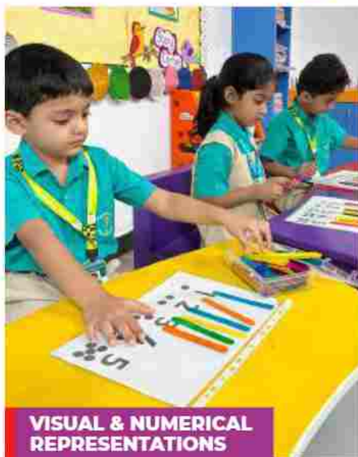
VISUAL & NUMERICAL REPRESENTATIONS